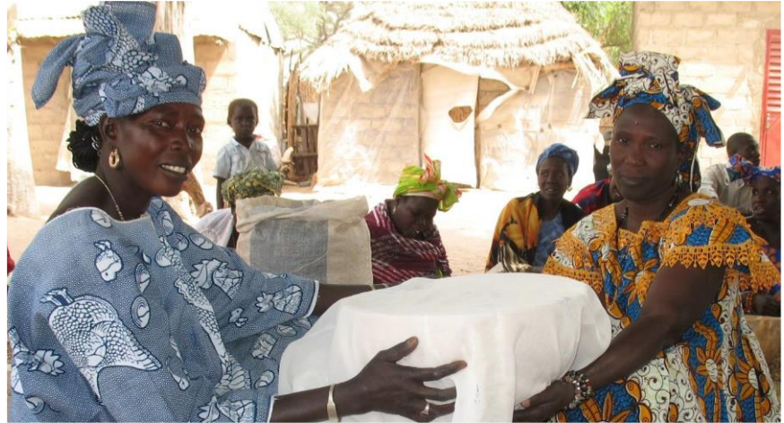
The calabash, into which members place their contribution, is covered with white cloth, symbolising peace of the heart

Two features are especially striking about Solidarity Groups in Senegal. First, whereas groups in other countries are roughly gender-equal, 86 percent of members in Senegal are women. Second, while in other countries members contribute mutually agreed equal amounts into the group fund, the Senegalese groups are funded via a unique and fascinating system.