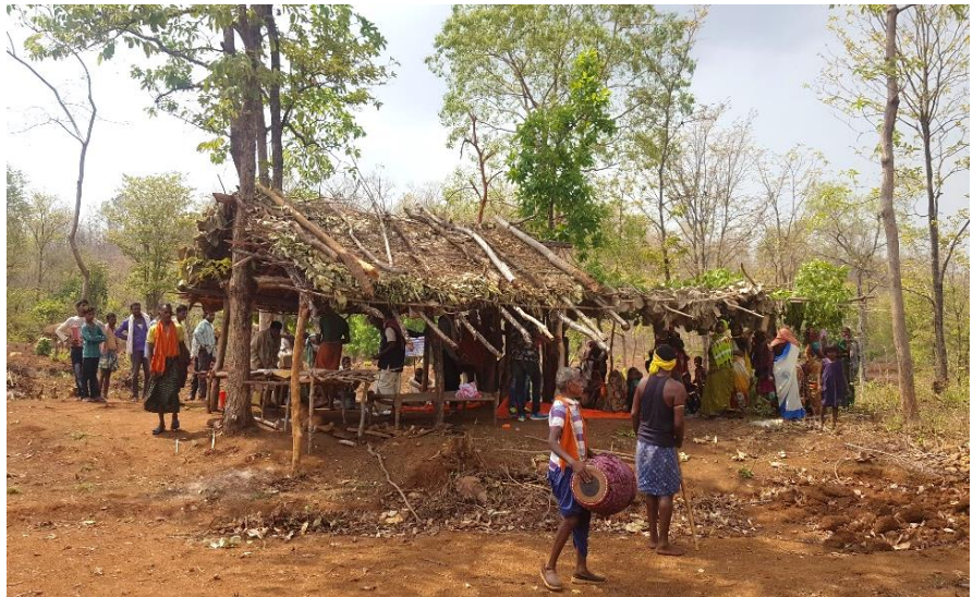
An Adivasi Solidarity Group meeting on claimed land, fighting to gain their formal land title

All members of the target group are landless and living in debt bondage, which means they are in a state of extreme exploitation at the hands of local dominant groups. They have often been in bondage for several generations by the time they form Solidarity Groups. Solidarity Groups in India heavily emphasise that members must gain ownership of land. Their struggle for economic and social independence challenges the power of dominant groups, which places them at a very real risk of acts of violent reprisal from local elites. Many members as well as programme animators have been abused, incarcerated, beaten, and some have even been murdered.